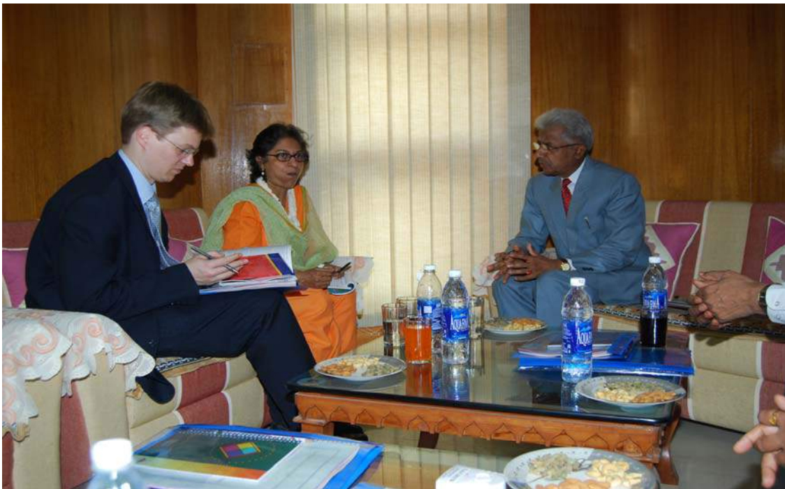
Discussions with the Gujarat State Human Rights Commission officials