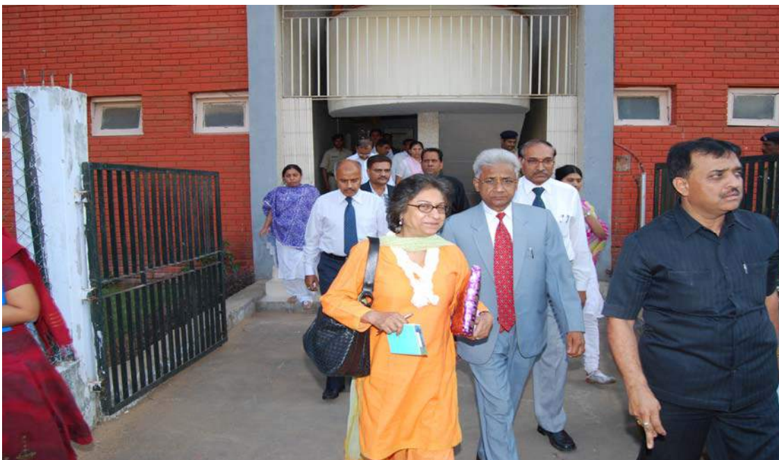
Ms. Asma Jahangir from Seeing off Gujarat State Human Rights Commission.